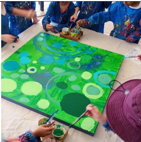
Messy Play – Circles & Mark Making

Finally, we moved into the Bling stage , where paint pens were used to add detailed decorative layers. Participants enhanced existing patterns, added highlights, and incorporated gems, stickers, and glitter for sparkle and contrast, bringing energy and richness to the final piece.