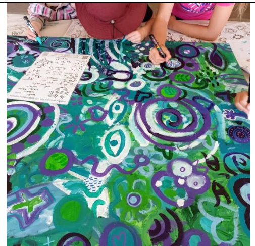
Bling – Paint Pen & Glittery Bits!